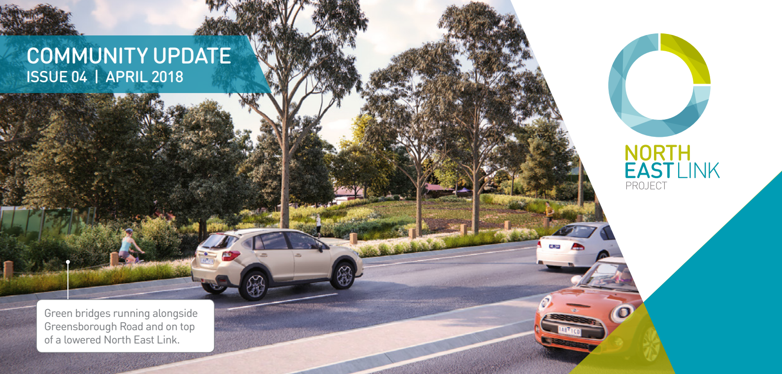
Green bridges running alongside Greensborough Road and on top of a lowered North East Link.