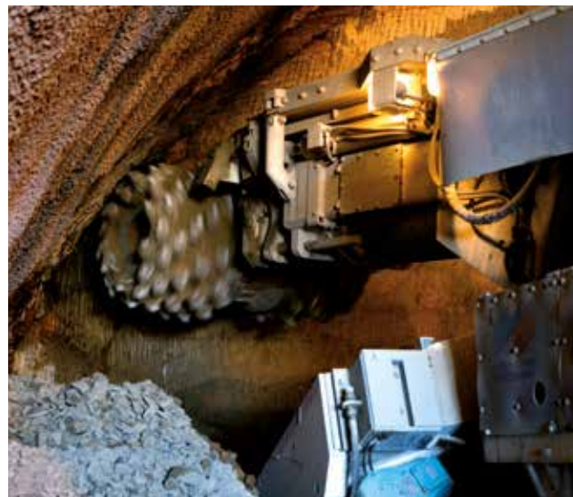
EastLink was built underground using road headers.