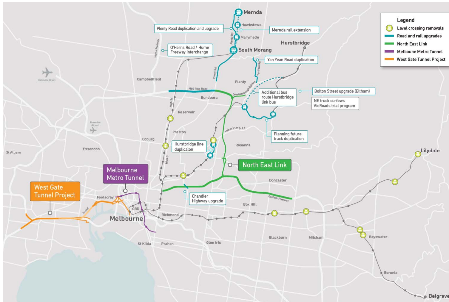
Figure 1-2 Other projects with links to North East Link