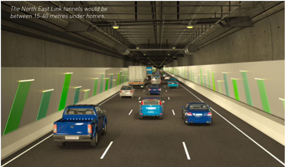
The North East Link tunnels would be between 15-40 metres under homes.

Modelling is being undertaken to predict the levels of vibration that might be experienced at properties above the tunnel and to assess predicted levels against relevant Australian and international standards relating to amenity and structural integrity.