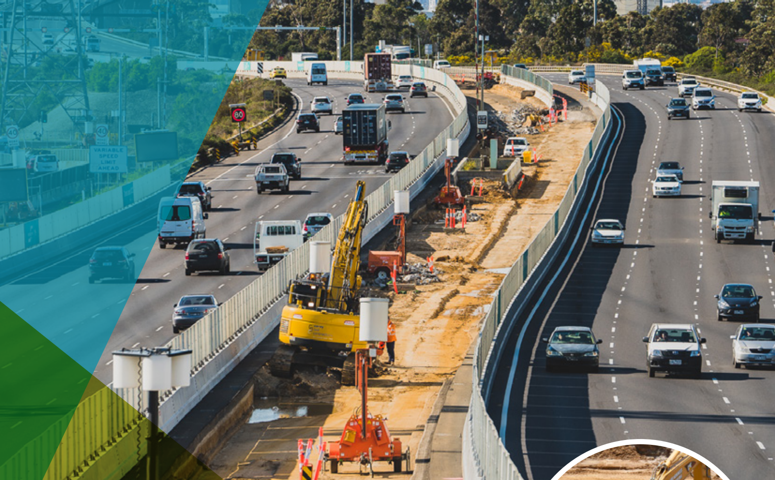
Upgrade works on the West Gate Freeway